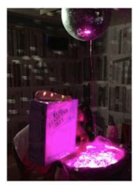
A riot ghoul at Killjoy's Kastle