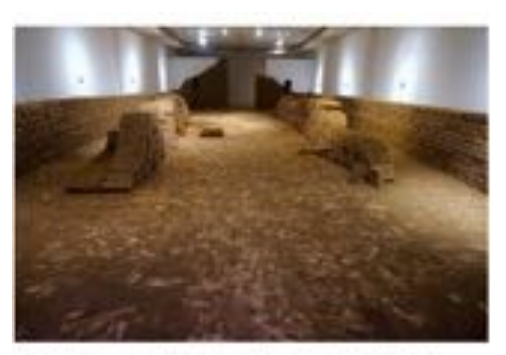
'Rafa Esparra: i have never been here before' at LACE

#5 – Rafa Esparza: i have never been here before at Los Angeles Contemporary Exhibitions (LACE)