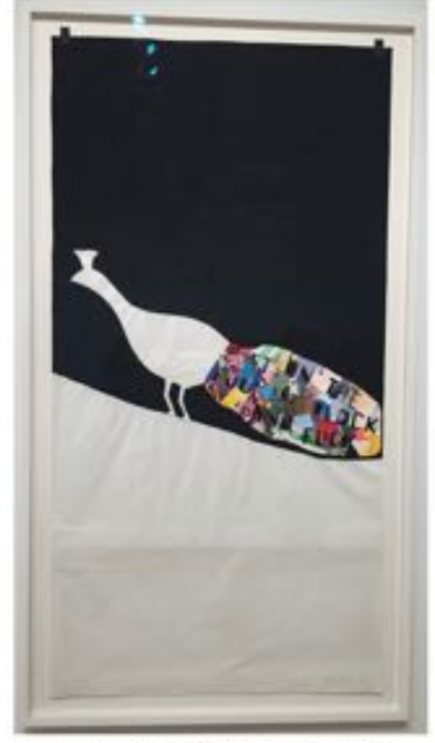
Frances Stark, "Get on the fucking block and fuck. Or don't" (2008) (detail), vinyl paint, collage on rice paper backed with mylar, 2 parts, each 185 x 96 cm

recontextualizing them in the white cube of the museum and giving visitors a taste of what awaits them a few hours drive east. -MS