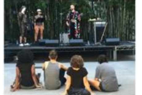
Active Pass performing as part of the Hammer Museum's 'All the Instruments Agree'