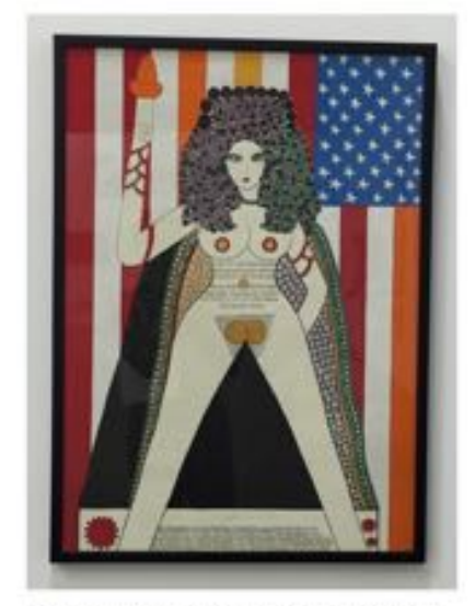
Dorothy lannone, "The Statue of Liberty" (1977) in 'Let Power Take a Female Form' at The Box (photo

Unlike their marble counterparts, bronze sculptures rarely survived antiquity, as people preferred to reuse the precious material rather than let it languish as a non-utiliarian object. There's nothing like standing in a room of life-size bronzes to understand the skill of ancient artisans who continue to inspire contemporary imitators and admirers. — Hrag Vartanian