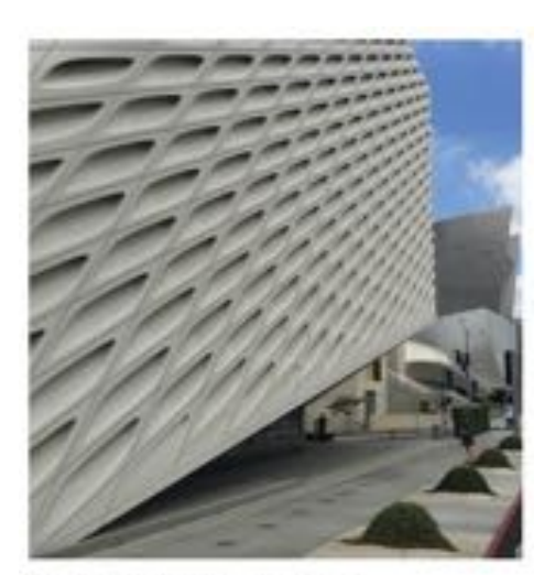
The Broad Museum